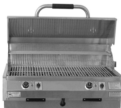
32" MODEL IS 4400-EC-448-IM-D-32 (DUAL CONTROL)

Required Outlet: NEMA 6-30R Receptacle 208/220 Volt 30 Amp receptacle 50/60 Hz