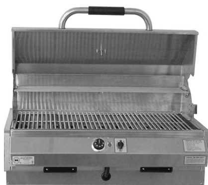
32" MODEL IS 4400-EC-448-IM-S-32 (SINGLE CONTROL)

Required Outlet: NEMA 6-50R Receptacle 208/220 Volt 50 Amp receptacle 50/60 Hz (use with 40 Amp breaker)