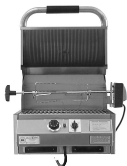
16" MODEL IS 4400-EC-224-IM-16