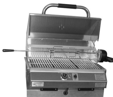
24" MODEL IS 4400-EC-336-IM-24

Required Outlet: Nema 6-20R Receptacle 208/220 Volt 20 Amp receptacle 50/60 Hz