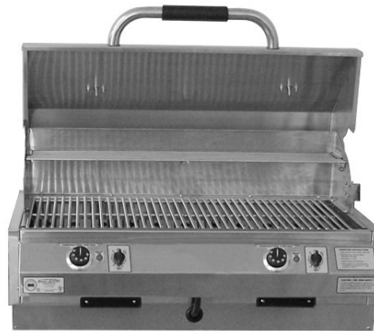
32" MODEL IS 4400-EC-448-I-D-32 (DUAL CONTROL)

Required Outlet: NEMA 6-30R Receptacle 208/220 Volt 30 Amp receptacle 50/60 Hz