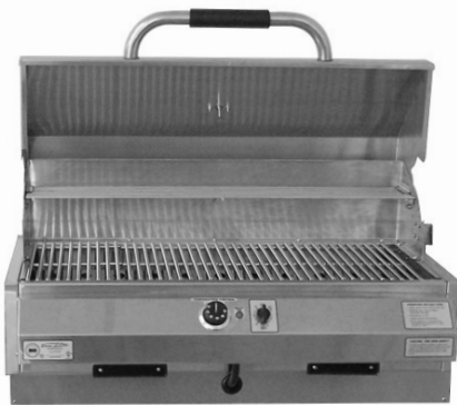
32" MODEL IS 4400-EC-448-I-S-32 (SINGLE CONTROL)

Required Outlet: NEMA 6-50R Receptacle 208/220 Volt 50 Amp receptacle 50/60 Hz (use with 40 Amp breaker)