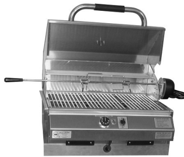
24" MODEL IS 4400-EC-336-I-24

Required Outlet: Nema 6-20R Receptacle 208/220 Volt 20 Amp receptacle 50/60 Hz