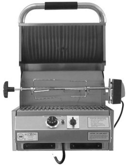
16" MODEL IS 4400-EC-224-I-16