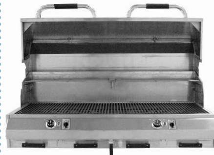
48" MODEL IS 8800-EC-1056-I-D-48

Required Outlet: Nema 6-20R Receptacle 208/220 Volt 20 Amp receptacle 50/60 Hz